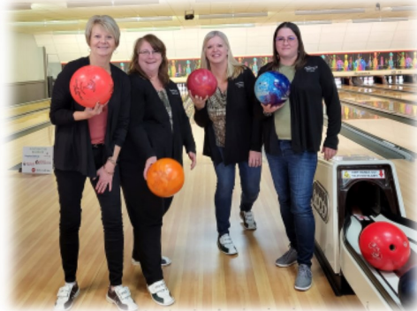
Chamber mini golf "ParTee" and bowling outings